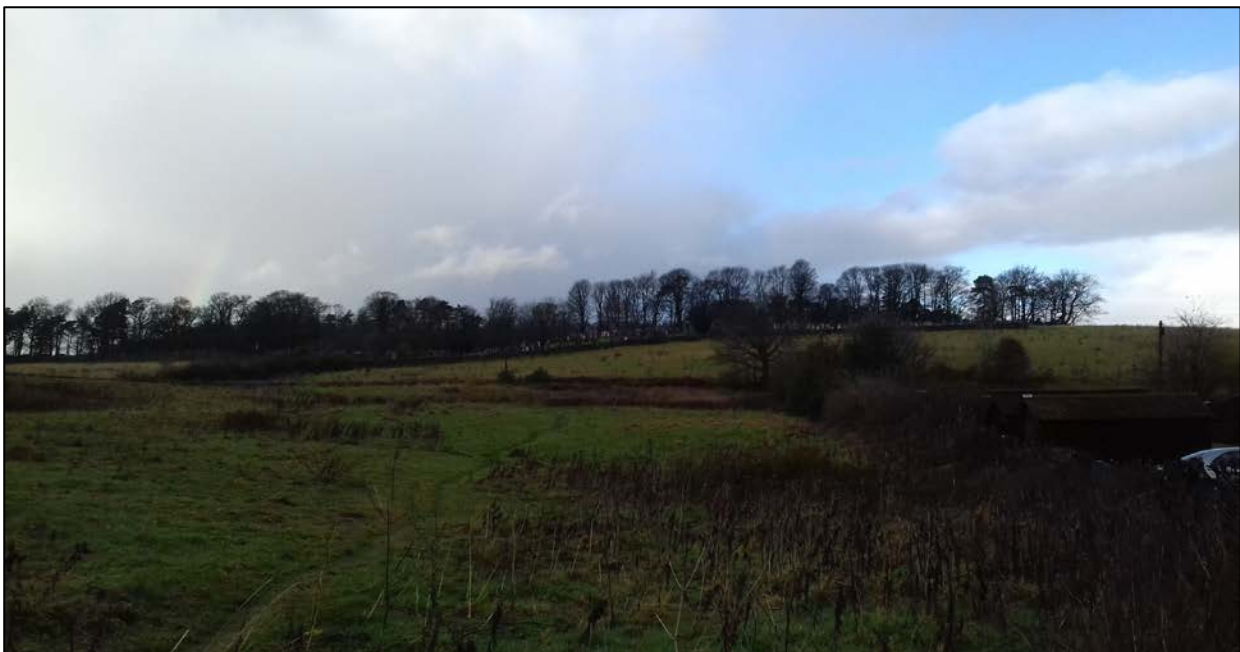
View across site towards Kilmacolm Cemetery from area adjacent to Quarry Drive, looking north-west

The applicant considers that as a result of the quashing of Chapter 7 of the adopted LDP that there are currently no housing policies or land allocations within the LDP and so the policies in these respects are out-of-date. The applicant also considers there is a shortfall in the 5 year supply of effective land for all tenure and private sector housing development in the Inverclyde Council area, and for private sector housing in the Inverclyde part of the Renfrewshire Sub-Market Housing Area (i.e. Kilmacolm and Quarriers Village).