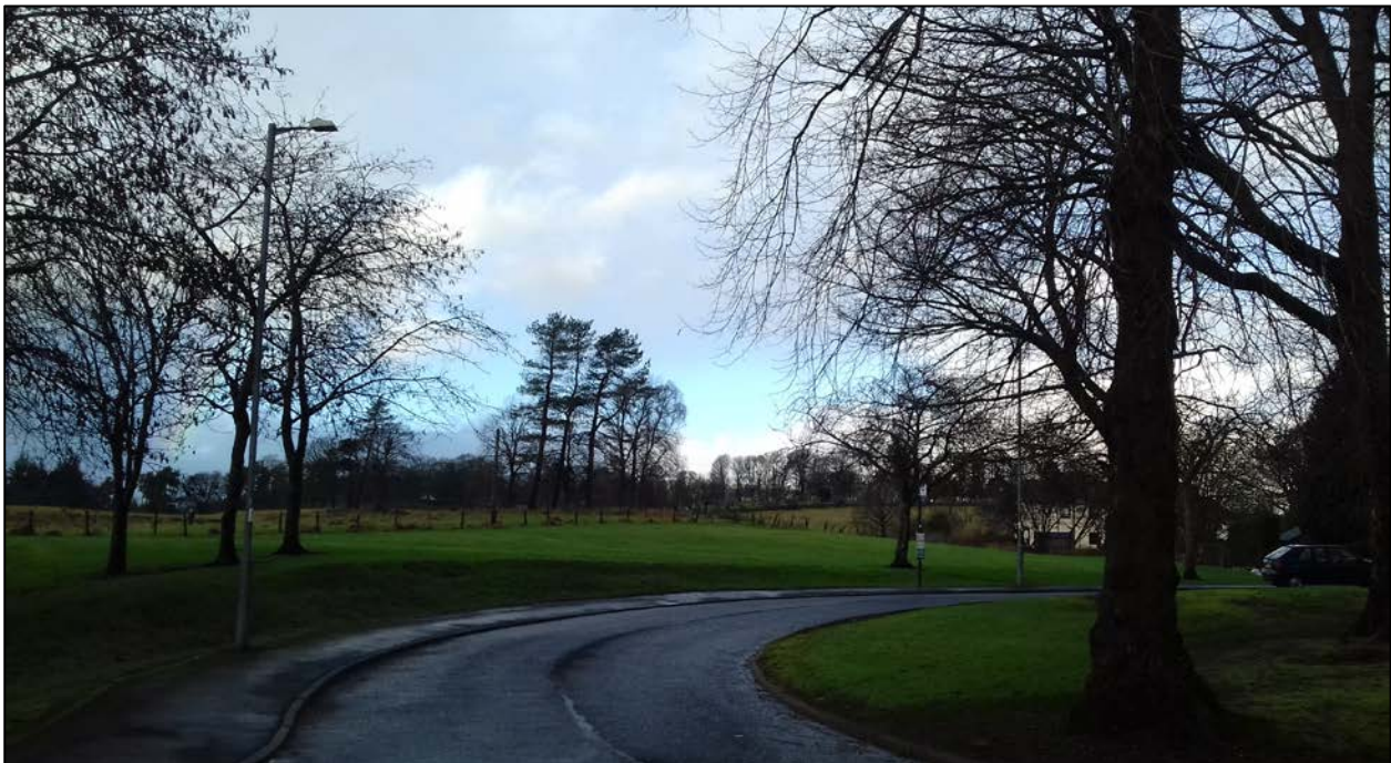
Entrance to site from roundabout at Wateryetts Drive, looking north-west

No details of this have been given in the application although it is likely that digital connections will be made by providers of these services.