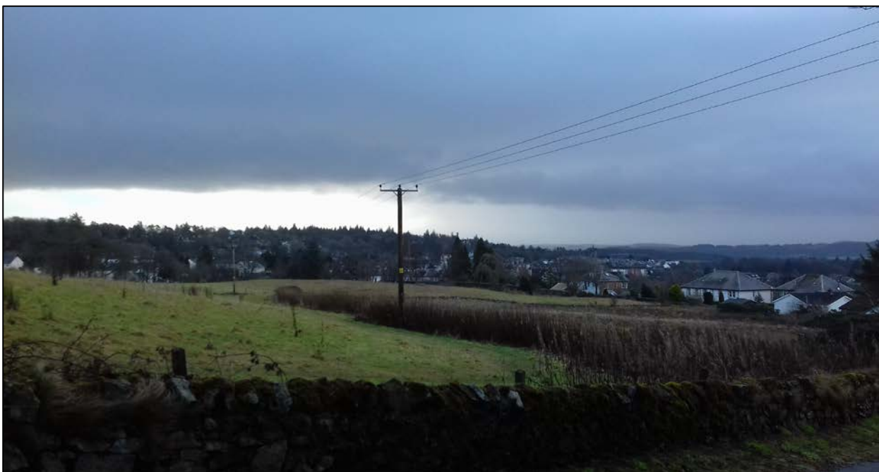
Site as viewed from road to Kilmaccolm Cemetery, looking south-east

Policies 1, 12 and 16 covering Placemaking, Managing Flood Risk and Drainage, and the Green Network and Green Infrastructure respectively are also of relevance. This development is of a strategic scale as defined in Schedule 14 as it involves Greenfield Housing of 10 or more units outwith the Community Growth Areas as well as being a site outwith those identified in the LDP.