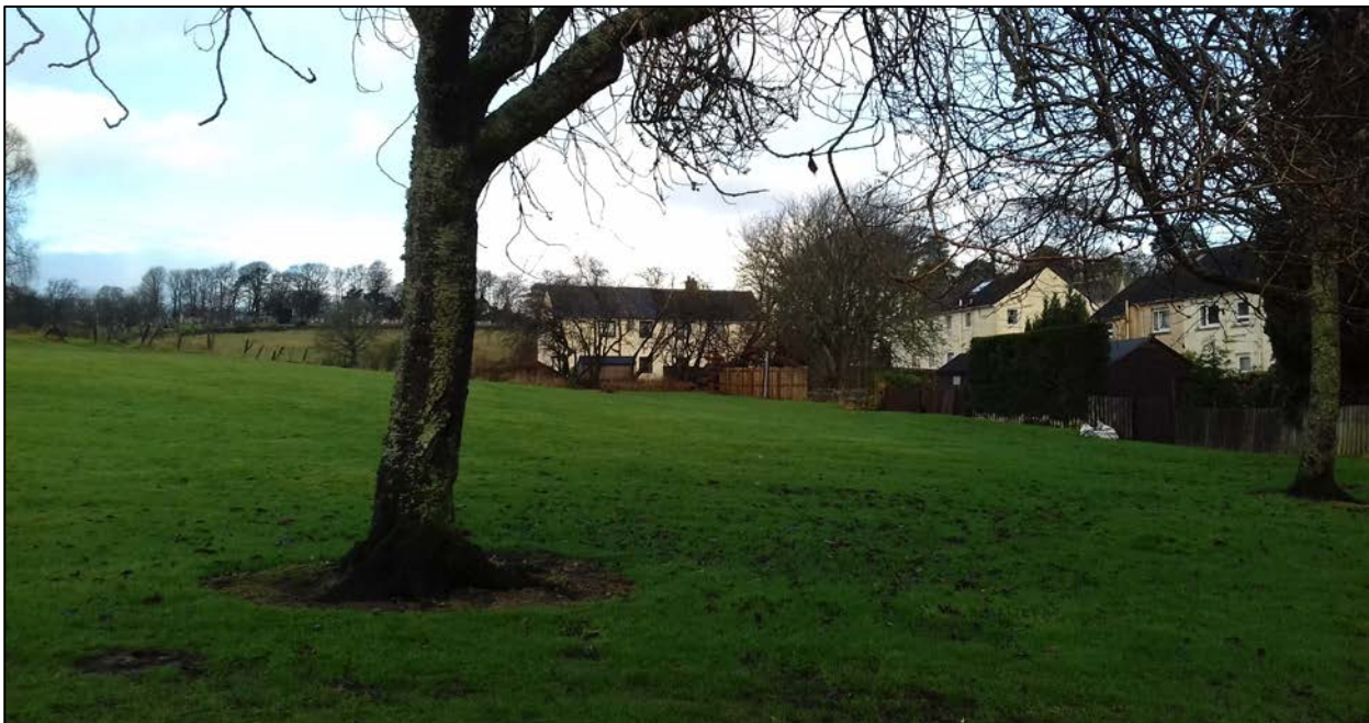
View across site towards rear of houses on Springwood Drive and Quarry Drive from open space adjacent to the roundabout on Wateryetts Drive

Ecological issues are considered by the applicant in the submitted Ecological Appraisal. These must also be considered with reference to the Green Belt objectives of maintaining the role of the environment in terms of biodiversity. This notes the site comprises semi-improved grassland, scrub, two small areas of wet flush, improved grassland previously grazed by horses, stone walls, mature/parkland trees and hedgerows. The habitats and plant species recorded within the site boundaries are indicated as widespread and common throughout the central belt with no further habitat assessment currently advised. In addition it notes part of the Local Nature Conservation Site (LNCS) lies to the immediate north-east of the site boundary and this is unlikely to be affected by the development within the site boundary.